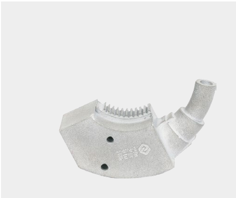
3D printed mold with conforming cooling channels in Maraging Steel