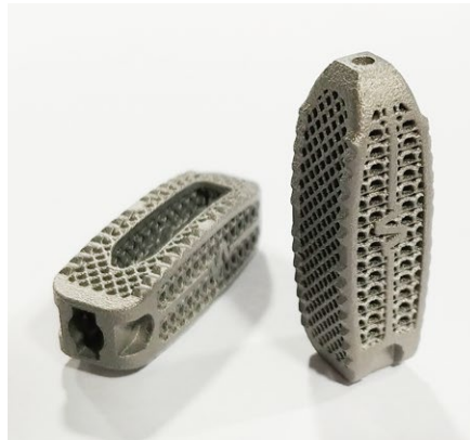
Lumbar Interbody Fusion Cage System in Titanium Alloy