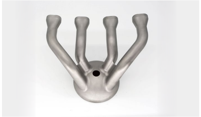
Exhaust pipe in Nickel Alloy