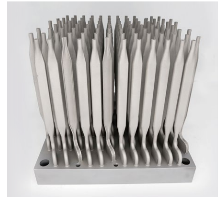
Batch production of industrial pipes in Stainless Steel