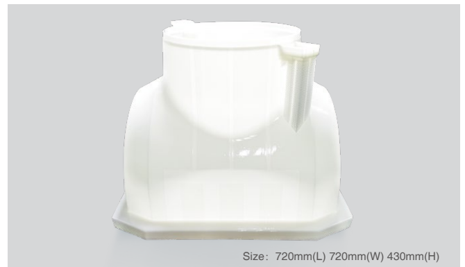
Size: 720mm(L) 720mm(W) 430mm(H)