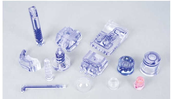
· Transparent resin parts